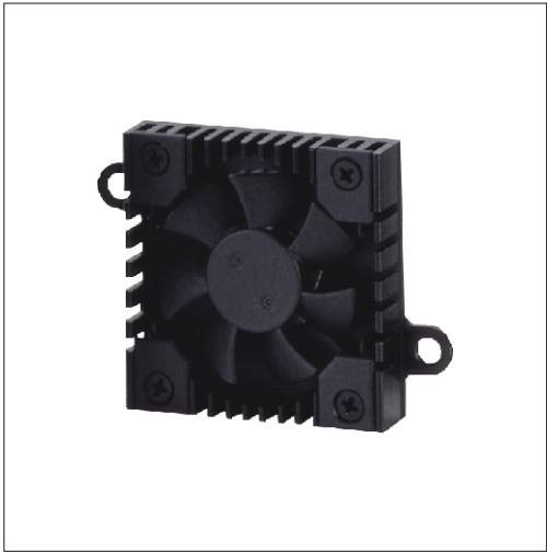
Spot cooling,also suitable for small space requirements, laptops PC and notebook,etc,.